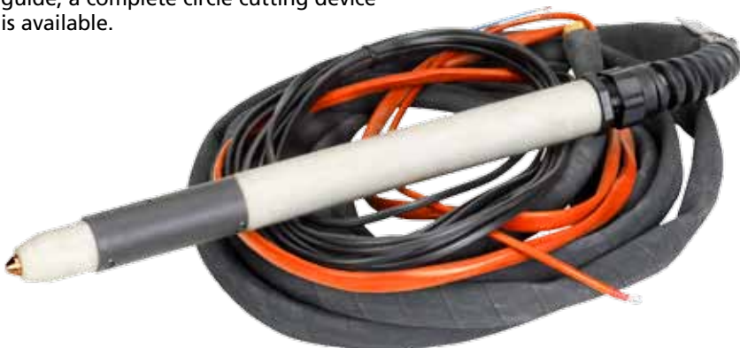
Plasma torch Automation, 6 m complete Article no. 80690096

Both torches are designed with a safety circuit for protection of the user which ignites by means of the Pilot arc and without use of HF. This patented system ensures long service life of wear parts and prevents EMC noise in the supply network.