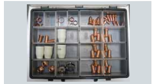
Wear parts kit Article no. 81100239

MIGATRONIC ZETA 100 PLASMA TORCH - FULLY EQUIPPED, READY FOR USE