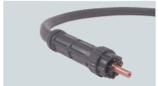
Application solution: ZA model