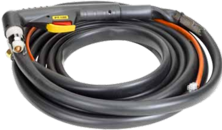
Plasma torch, 6 m complete Article no. 80690095

For the Zeta 100 plasma cutter, there are two air-cooled, robust types of torches for manual or automated cutting and gouging. As standard, the Zeta 100 is supplied with a 6 m complete plasma hose for manual cutting. For an automated cutting setup, an automatic torch for mounting in fixture can be supplied. Both types of torches use the same cutting/gouging wear parts and can be used for alle types of materials.