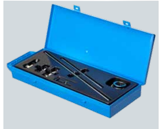
Complete circle cutting device Article no. 80600210